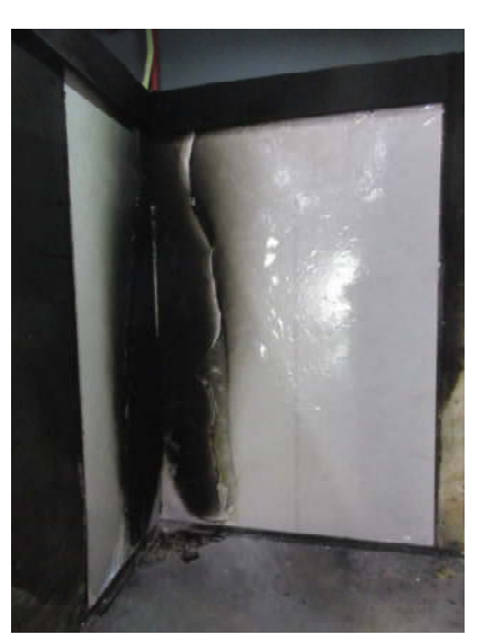
After Test (EN 13823)